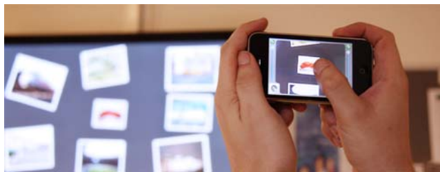
Figure 1. Touch Projector: interacting through the display.

it immediately through the live video image shown on the personal display (see Figure 1). In this paper, we review the strengths of this interaction technique in terms of spontaneously interacting with large public screens in a semi-private fashion.