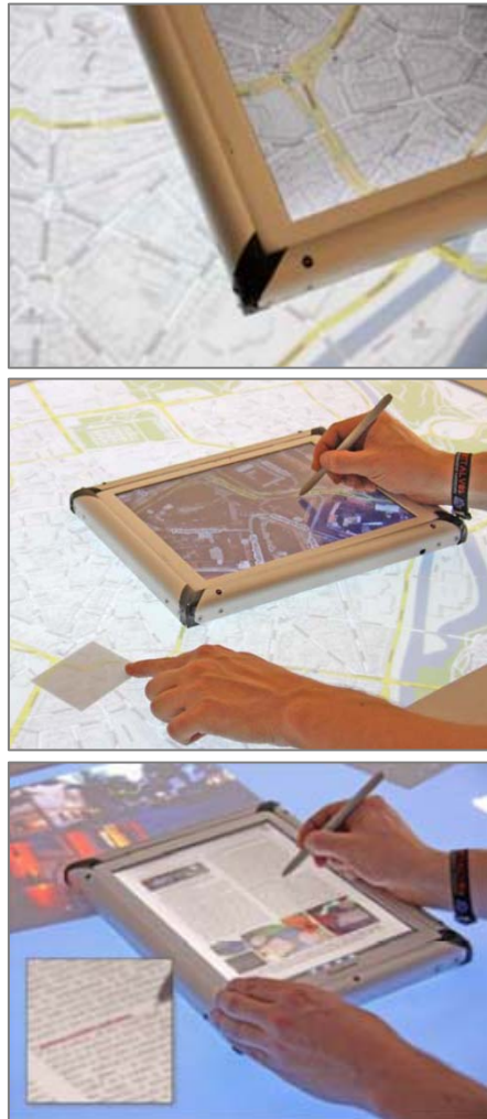
Figure 3. The ThruSight prototype (top). Center shows the remote lens and bottom denotes the application frame.

the tablet PC physically over moving the content on the tabletop virtually . And second, the moving of information “through the display” versus across the display’s bezel does not show any preferences by users.